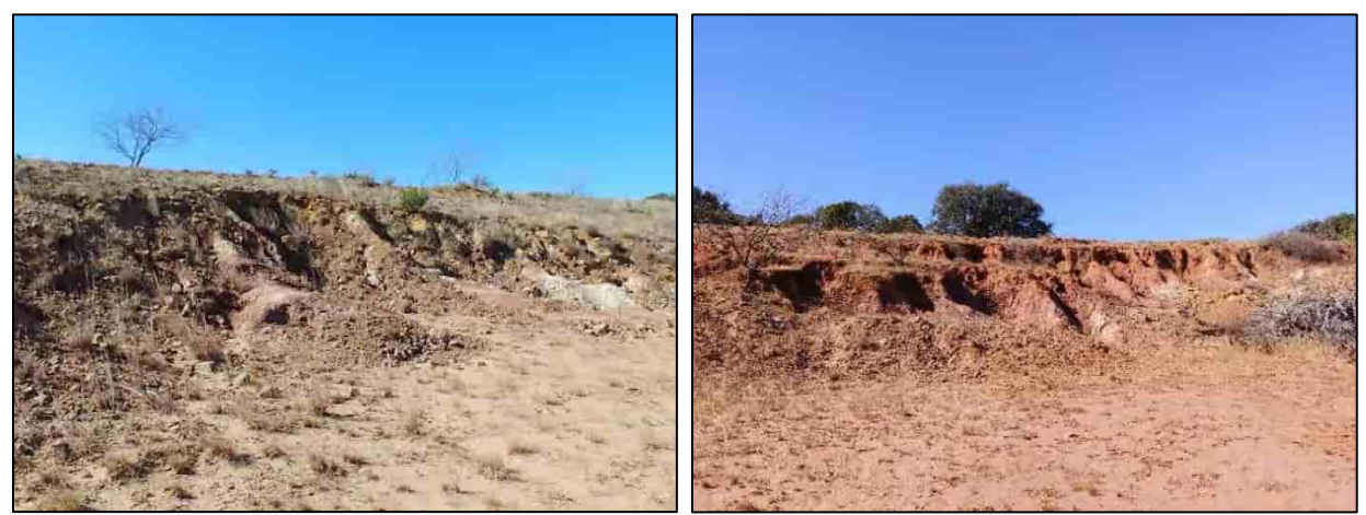
About 50 ft upstream of crestAbout 200 ft upstream of crestFigure 3-6. FRS No. 5 Auxiliary Spillway Erosion at Right Cut Slope