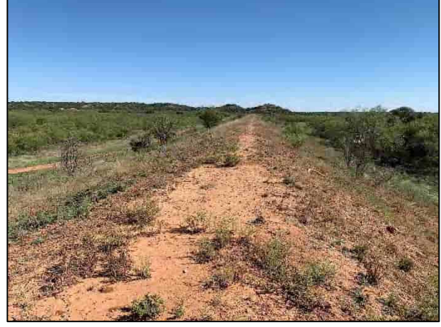
Crown of dam and embankments (10/2020)

Photos of the embankment and some areas of longitudinal cracking are provided in Figure 3-3.