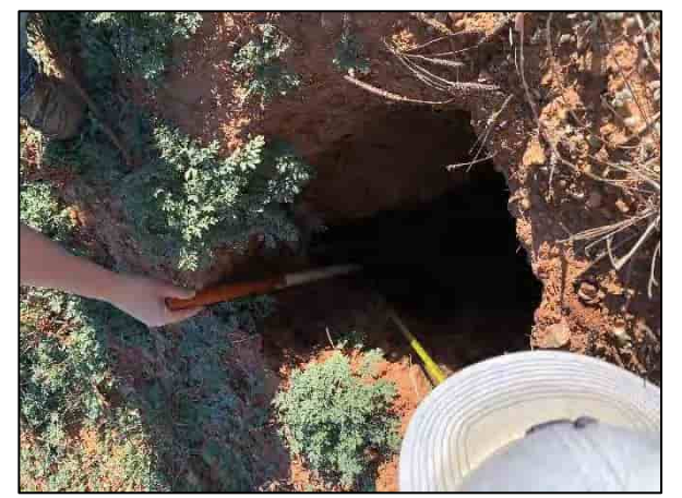
Large hole resulting from longitudinal cracking. (10/2020)