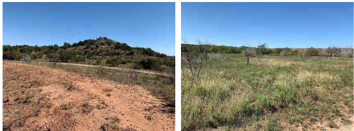
Auxiliary spillway control section (10/2020)

the auxiliary spillway and through the control section. Photographs of the existing auxiliary spillway system are provided in Figure 3-2 .