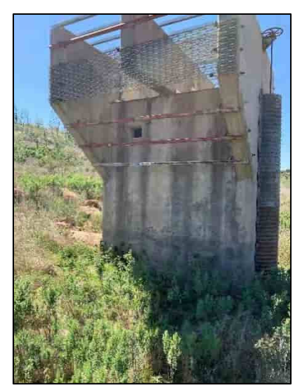
Inlet structure (10/2020)

The principal spillway inlet structure is a drop inlet (30 inches x 100 inches x 12 feet, 1 inch tall) with a steel debris guard and a crest of 1985.3 feet. There is one low-level port on two sides of the riser (two ports total - each 8 inches tall x 12 inches wide) at elevation 1983.0 feet. The conduit is 220 feet of 30-inch-diameter prestressed, concrete lined, steel cylinder pipe with five anti-seep collars. The spillway riser is generally in good condition. Minor corrosion on the debris guard should be monitored and repaired as needed. The outlet conduit is in good condition. According to local reports from the Sponsors, the water level was above the principal spillway crest during a storm that occurred around August 2007. This is the only documented instance of the water level being above the principal spillway crest, although there are anecdotal reports that it may have also happened on a number of occasions during the first ten years after the dam was constructed. Photographs of the existing principal spillway system are provided in Figure 3-1 .