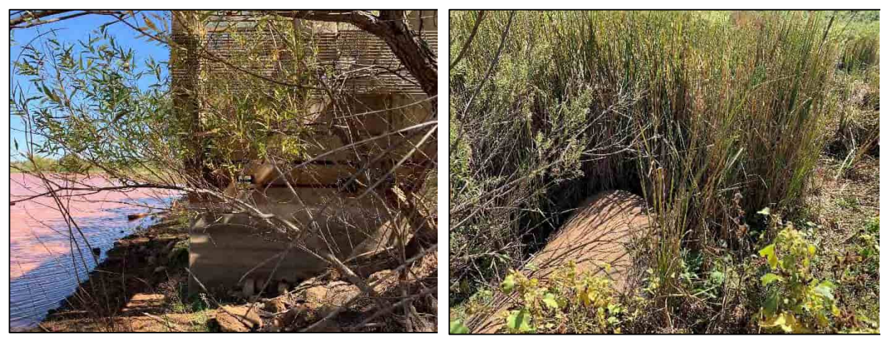
Inlet structureOutlet pipe.Figure 3-4. FRS No. 5 Principal Spillway Inlet and Outlet

The principal spillway inlet structure is a drop inlet (30 inches x 100 inches x 17 feet, 11 inches tall) with a steel debris guard and crest of 1899.0 feet. There are two low-level ports on two sides of the riser (four ports total - each 8 inches tall x 10 inches wide) at elevation 1894.5 feet. The as-built conduit is 220 feet of 30-inch-diameter prestressed, concrete lined, steel cylinder pipe with five anti-seep collars. The spillway is generally in good condition. Willow growth was observed around the principal spillway inlet and should be monitored until it can be removed. Minor corrosion was noted on the debris guard and should be monitored and repaired as needed. Some concrete deterioration was observed at the end of the outfall conduit. The conduit was partially submerged and was also blocked by vegetation. Photographs of the existing principal spillway system are provided in Figure 3-4 .