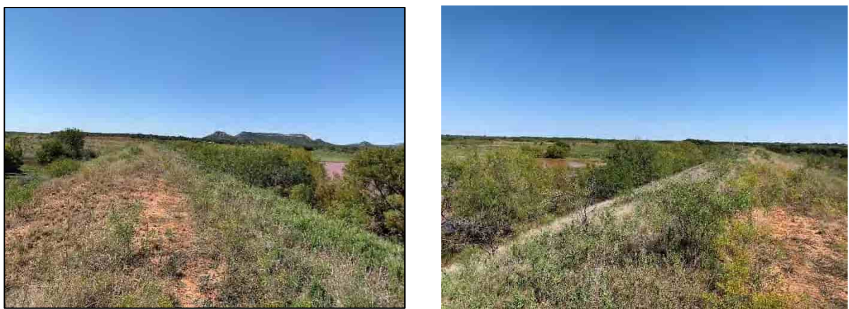
Crest and embankments Crest and upstream embankment Figure 3-7. FRS No. 5 Embankment Condition