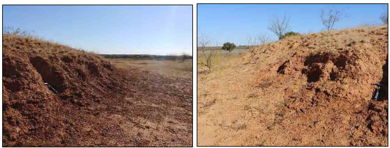
At right end of embankment, looking downstream At right end of embankment, looking upstream Figure 3-5. FRS No. 5 Auxiliary Spillway Erosion at Left Training Berm

The left berm of auxiliary spillway (adjacent to the right end of dam embankment) has eroded with possible damage by feral hogs, which is shown in Figure 3-5 . Additionally, the right cut slope from natural ground upstream of the auxiliary spillway crest has severe erosion gullies, which is shown in Figure 3-6 . The spillway channel currently has a fair to good protective grass cover and is in fair condition with no visible erosion.