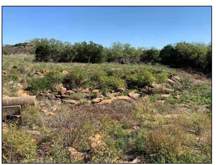
Outlet pipe and plunge pool (10/2020)