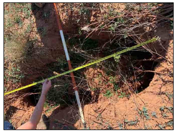
Large hole resulting from longitudinal cracking. (10/2020)