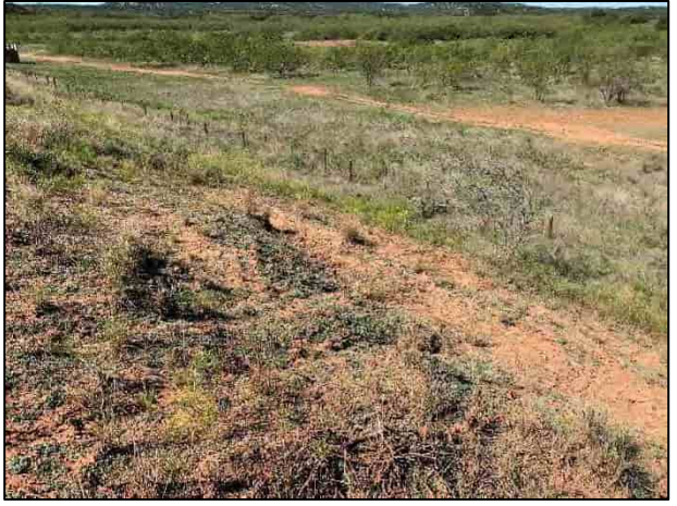
Upstream slope (10/2020)